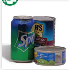
Aluminum and Steel Cans empty and rinse