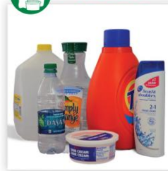
Kitchen, Laundry, Bath: Bottles and Containers empty and replace cap