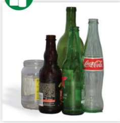
Bottles and Jars empty and rinse