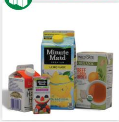
Food and Beverage Cartons empty and replace cap